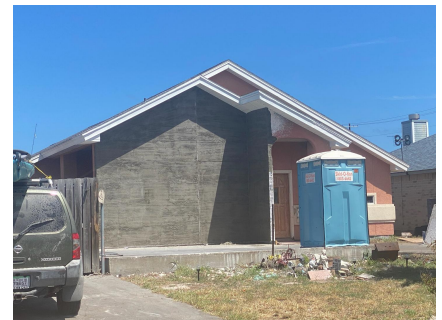
15218 Reales Dr. before & after