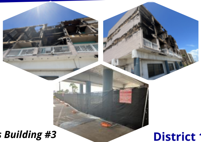
Villa Del Sol Condominiums Building #3

Villa Del Sol Condominiums - 3938 Surfside Blvd. - Occupied Property Structure Fire August 9, 2024 | Emergency Demolition cases were started on August 21st on multiple fire damaged units in building #3. To prevent accidents and ensure safety, the area affected by the fire has been fenced off. We will proceed accordingly until the fire damaged section of the building is demolished.