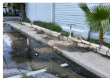
Puerto Del Mar Apartments sewage leak before & after clean-up