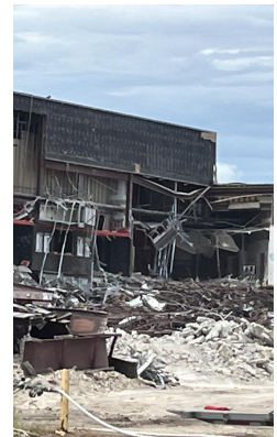
Sunrise Mall demolition in progress